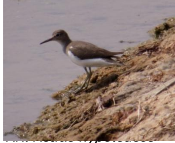
Plate 1. Continued