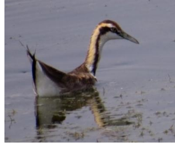
AF. Hydrophasianus chirurgus