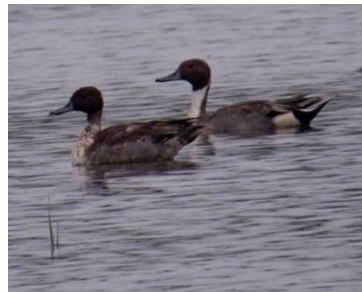
H. Anas acuta