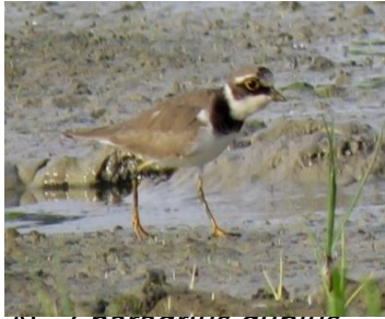
AE. Charadrius dubius