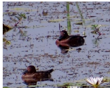
Plate 1. Recorded waterbird species in Pyu Kan Lake