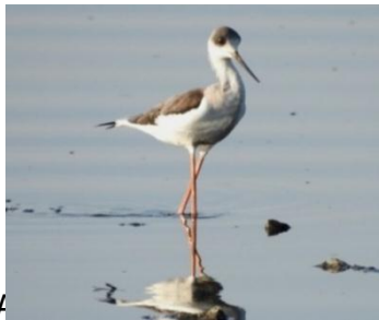
Plate 1. Continued