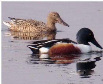
G. Anas clypeata