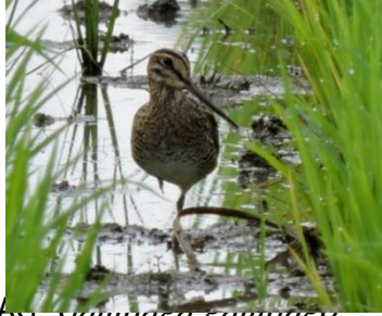
AG. Gallinago gallinago