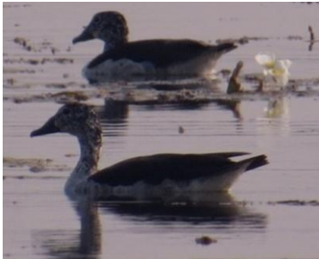
C. Sarkidiornis melanotis