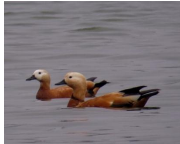
D. Tadorna ferruginea